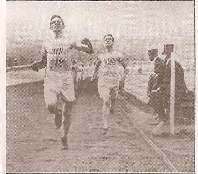
Melvin W. Sheppard, 1908 Olympic Games.